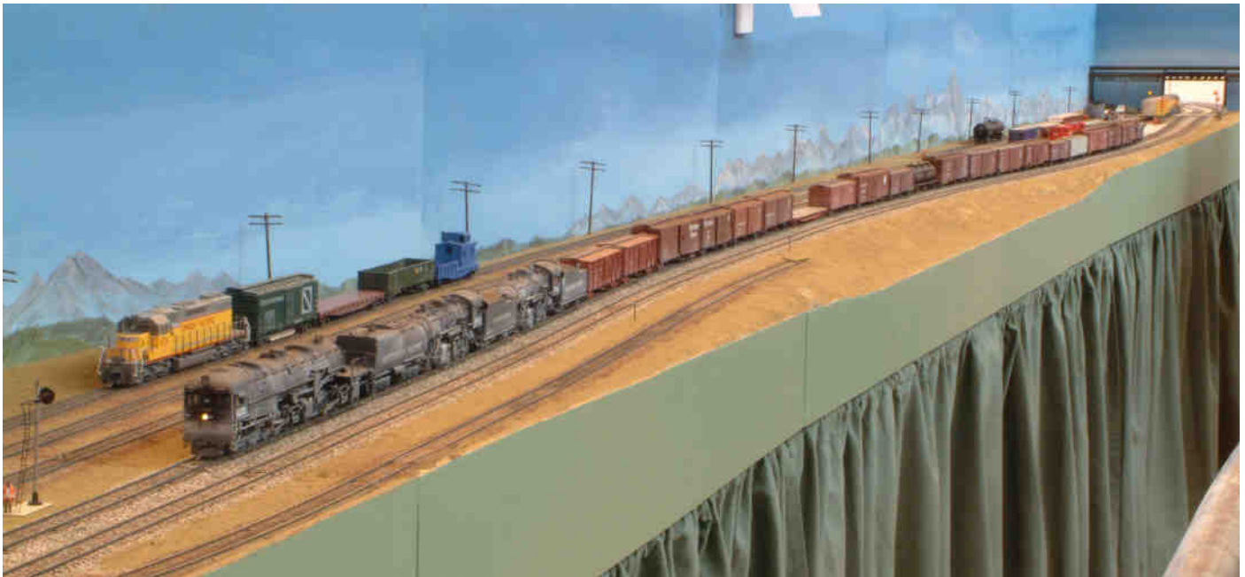
Anson Yard at the Plymouth Model Railway Exhibition

First off, please note that the September meeting has changed from the 16th to the 23rd, due to problems getting the whole layout to the meeting on that date.