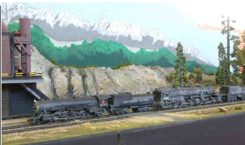
Two sound equipped steam locos double heading over Ken's new modules

Costs (Tea/coffee inc.)- £6 per person £3 under 16's