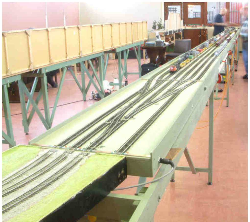
The new storage yard with 7 tracks, my 15 car freight is lost behind the Amtrak passenger train.

The new yard now allows space in Anson Yard (previously Pine Yard, but since the tree felling incident it was decided to come up with a better name) to carry out switching.