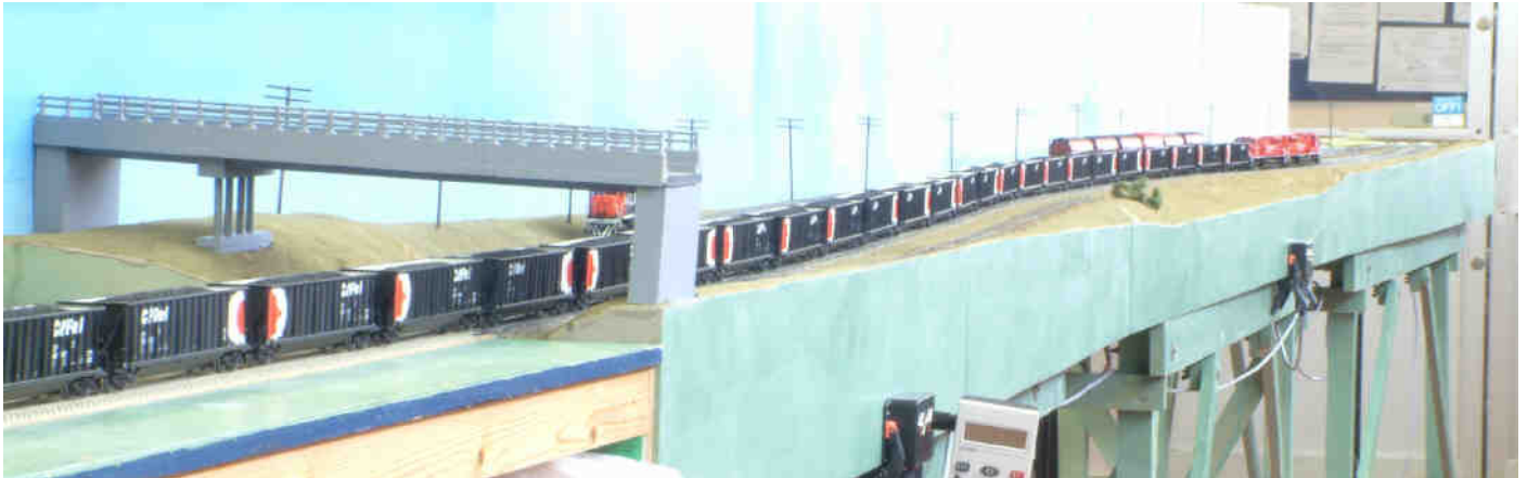
A long coal train runs down through Anson Yard. The new storage yard allows these long trains to be run.

First the bad news, our venue has put up the rent by about 80%. This means that we will have to increase the attendance fee to £6 per person, if attendance continues at the current numbers. Note this rate is still comparable to other venues.