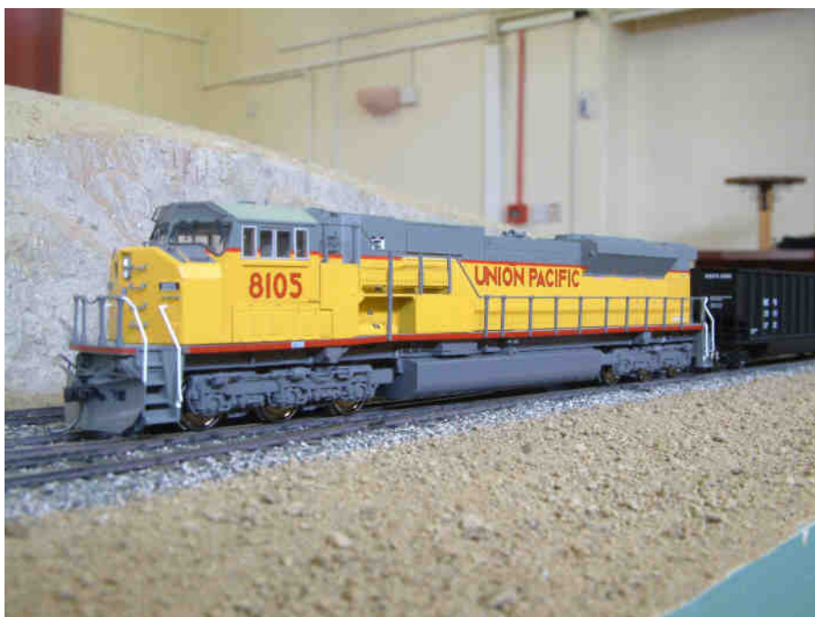
SD90MAC pushing on the rear of a coal train (note only dim head light is on)

Other layouts sometimes attend, and if you have one you would like to bring please contact me to ensure there is space.